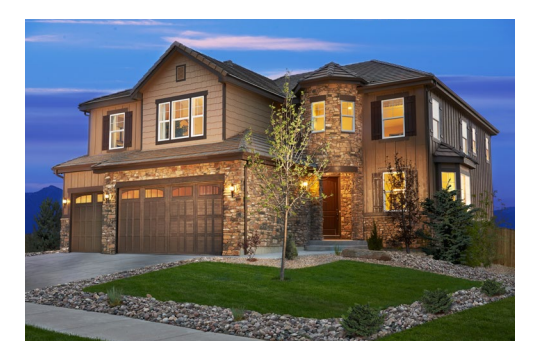
Ask your Richmond American sales associate about the Energy Wise Difference!™